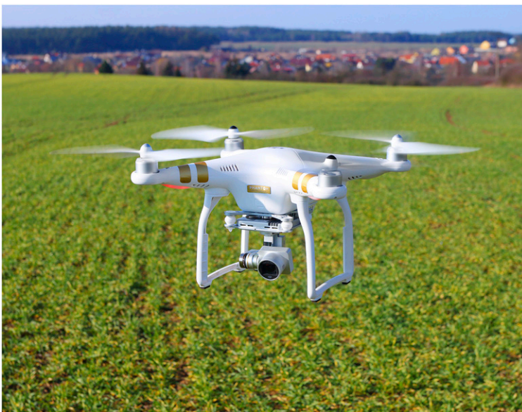
New technologies, such as unmanned aerial vehicles with powerful, lightweight cameras, allow for improved farm management advice.

Smart farming can make agriculture more profitable for the farmer. Decreasing resource inputs will save the farmer money and labor, and increased reliability of spatially explicit data will reduce risks. Optimal, site-specific weather forecasts, yield projections,